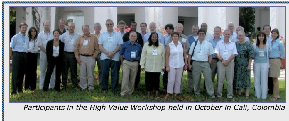
Participants in the High Value Workshop held in October in Cali, Colombia