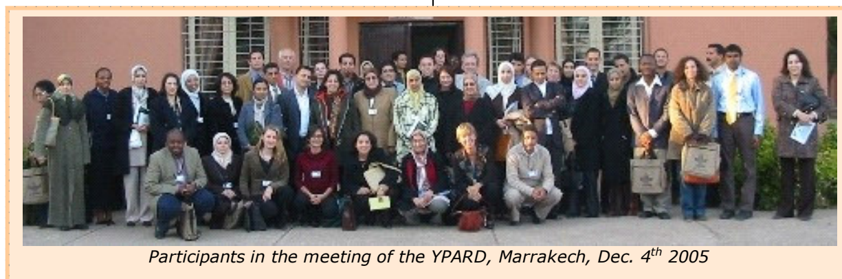
Participants in the meeting of the YPARD, Marrakech, Dec. 4 th 2005

About 70 Participants mainly youth, met on December 4, 2005 in the first ARD Youth Forum during GFAR 2005 Statutory meetings held at Marrakech, Morocco on 04-05 December. They discussed problems faced by young professionals, and how these issues could be addressed by a global, multi-stakeholder forum as proposed following the European Forum on Agricultural Research for Development (EFARD) 2005 conference. The meeting was supported by the CGIAR System Office and the GFAR Secretariat. During discussions it was clear that young