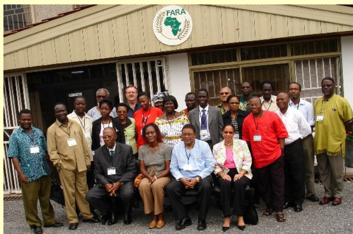
Participants in the Multi-stakeholder Consultation meeting held on 3 rd -7 th Oct. 2005 in Accra, Ghana

FARA convened a week-long multi-stakeholder consultation workshop during 3-7 October 2005 at the FARA headquarters at Accra, Ghana. The meeting brought together representatives from NGOs, farmer organizations, private sector, the Sub-regional Research Organizations (SROs) represented by CORAF/WECARD, Centre for Innovation in Development (Novafrica), and the CGIAR Centers in the region represented by IITA. The objective of the meeting was threefold: i) to develop an inclusive regional ARD agenda; ii) to provide the stakeholders with an opportunity to share and exchange information and knowledge; and iii) to sensitise the participants on recent developments in the ARD in the region.