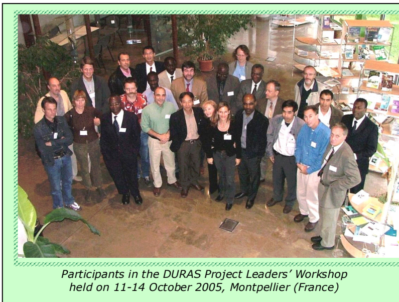
Participants in the DURAS Project Leaders' Workshop held on 11-14 October 2005, Montpellier (France)

Financial Reporting Framework as well as information and communication tools which can be used to facilitate interaction among project coordinators, including dissemination of project results, were agreed upon during the Workshop.